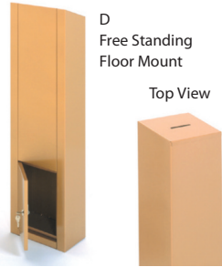
D Free Standing Floor Mount