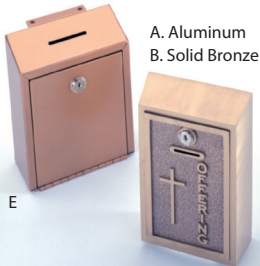
A. Aluminum B. Solid Bronze